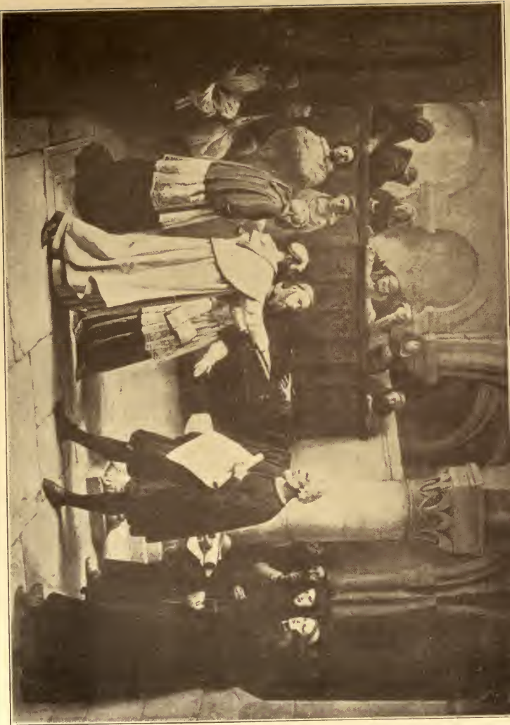
Columbus Before the Council of Salamanca