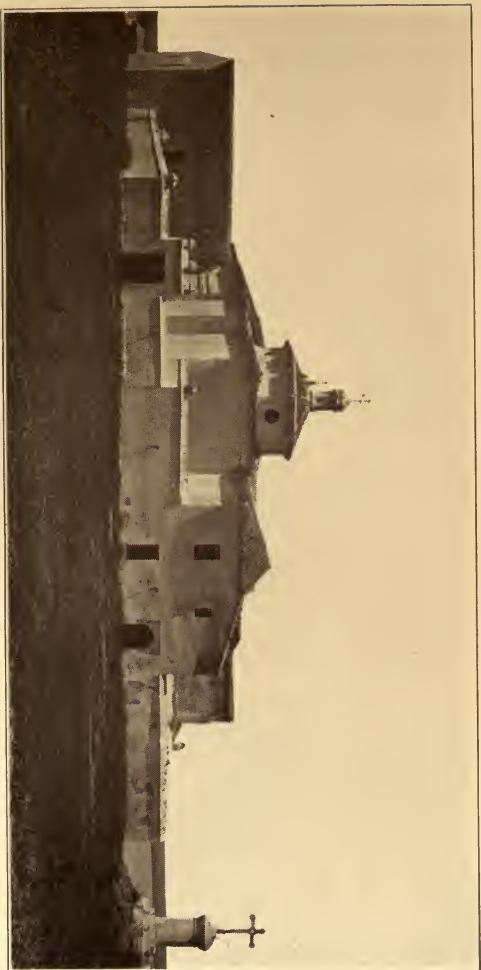
The Monastery of La Rabida, Huelva