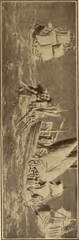
The Departure of Columbus from Palos