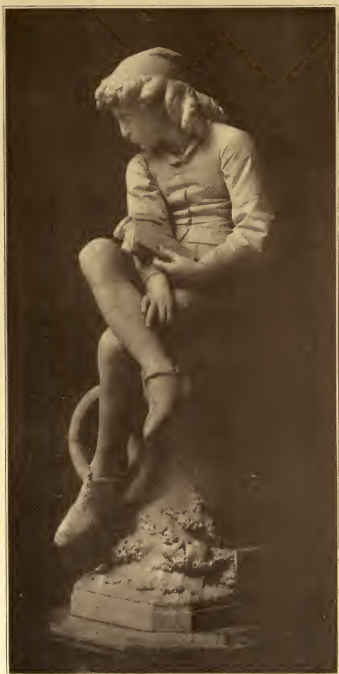
Giulio Monteverde The Boy Columbus In the Boston Museum of Fine Arts