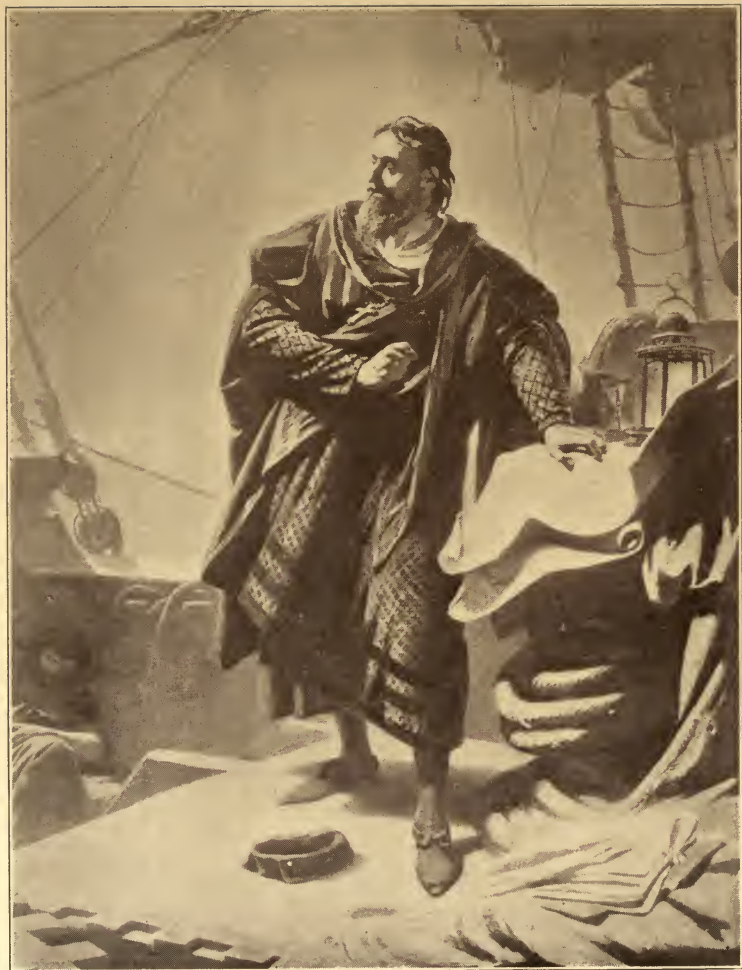
Columbus on Deck of the Santa Maria