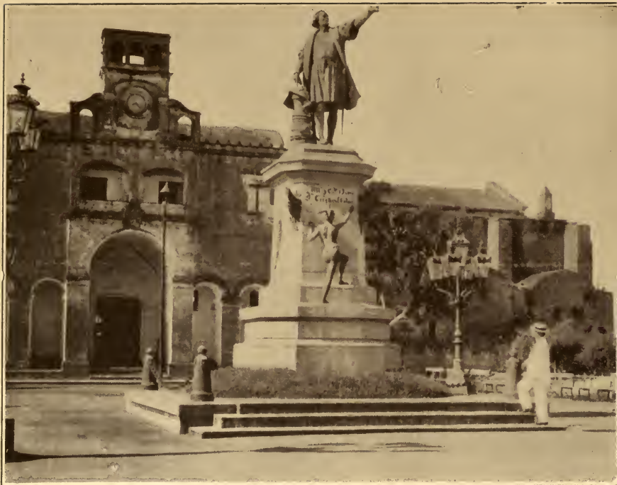
Statue of Columbus at Santo Domingo, Dominican Republic