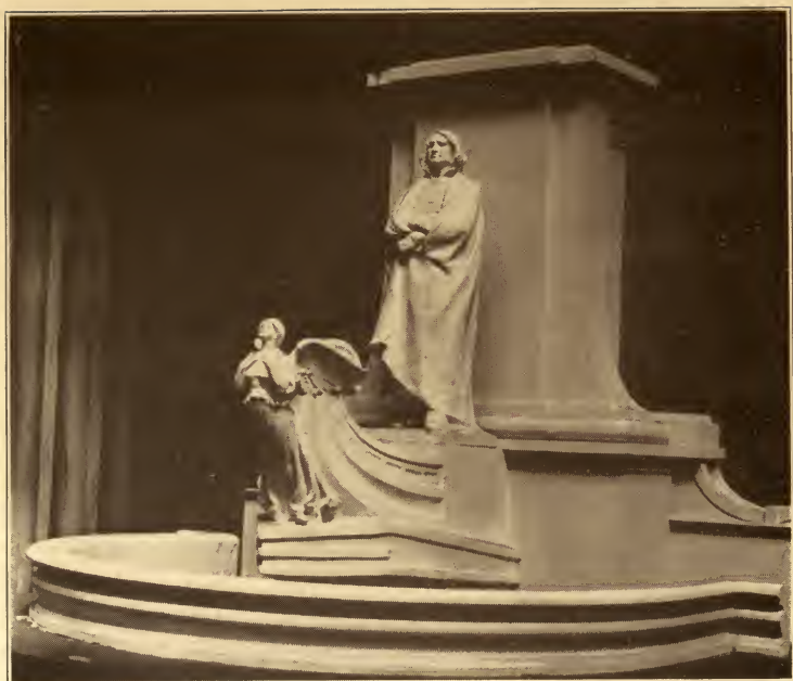
Columbus Monument and Fountain (Detail), Washington, D. C.