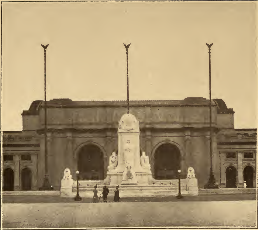
Columbus Monument and Fountain, Washington, D. C.