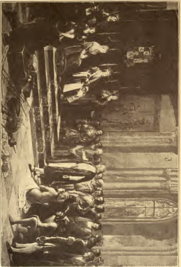
Columbus Received by their Catholic Majesties at Barcelona