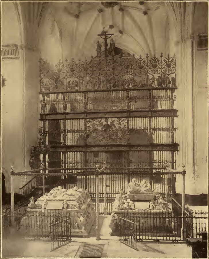
Tombs of Ferdinand and Isabella, at Granada