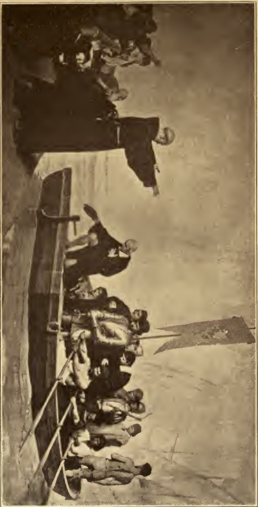
Columbus Taking Leave of Prior Perez