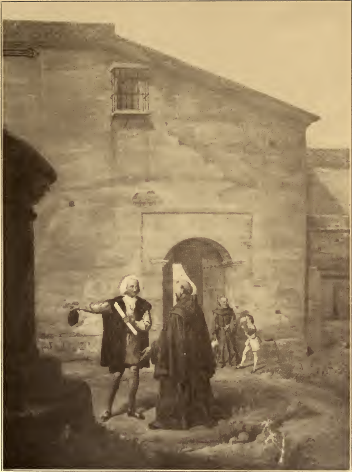
Columbus at the Convent of La Rabida