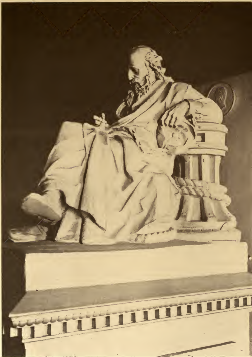
Columbus in Chains