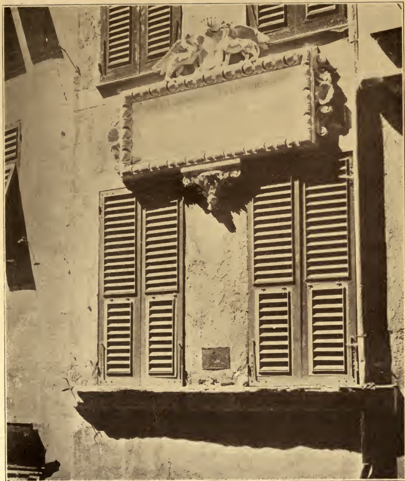
Home of Columbus's Boyhood, Genoa