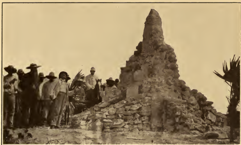
Columbus Monument at Watling's Island (San Salvador)