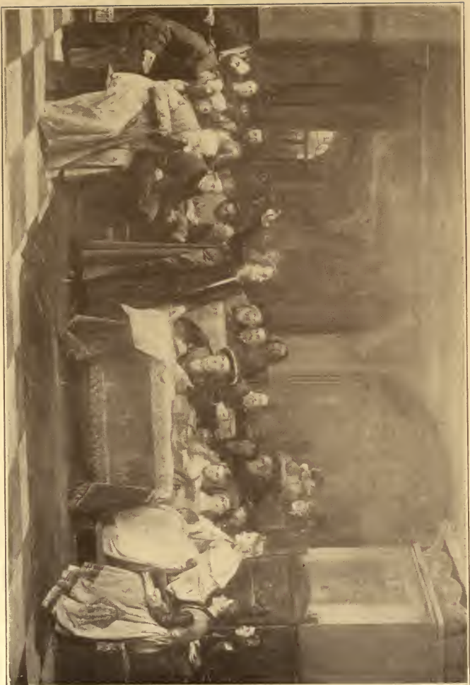
Isabella Pledging Her Jewels In the Metropolitan Museum of Fine Arts, New York