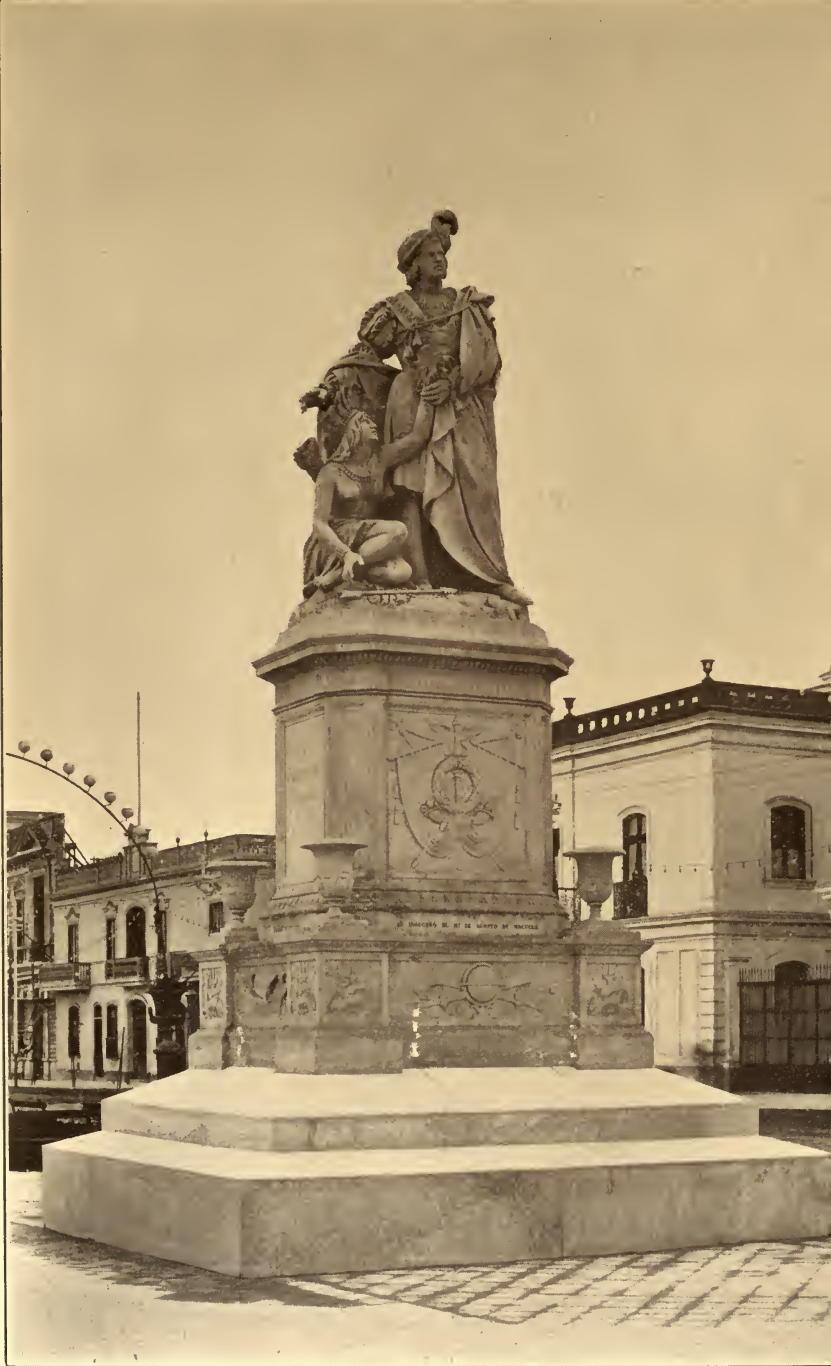
Statue of Columbus at Lima, Peru