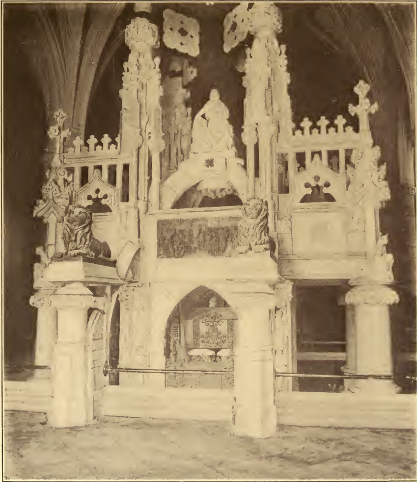
The Magnificent Mausoleum of Marble and Bronze erected in the Cathedral at Santo Domingo to contain the ashes of the Illustrious Discoverer of America